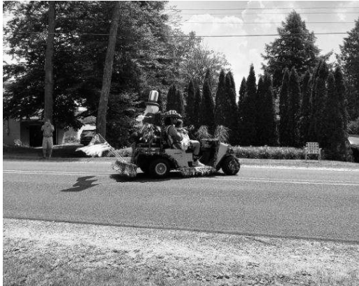
Marilyn Smith shared this photo of one of the 36 parade entries.

The 26th annual 'A Summer Day in Paradise' was a success! 'A Summer Day in Paradise' always begins with our Pancake Breakfast fundraiser. Dom Bertollini drove the Harbor Lights Grille Food Truck to the Carp Lake Township Pavilion and everyone enjoyed pancakes and sausage hot off the griddle! The breakfast raised $390 for the PLA.