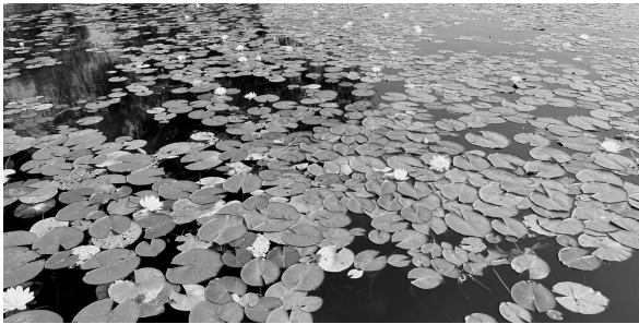
Lily pads near the shore at Chubb's Marina.

The mission of the Paradise Lake Association is to promote community preservation and conservation efforts to ensure the healthy future of Paradise Lake and its surrounding watershed.