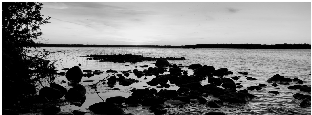
Stony Point Nature Preserve at sunset.

—Assist in the acquisition, establishment, maintenance, and protection of nature preserves, wilderness and other protected areas in the general vicinity of Paradise Lake and its connecting creeks, streams, rivers, and wetlands.