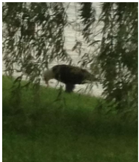
Eagle enjoying an interesting snack....