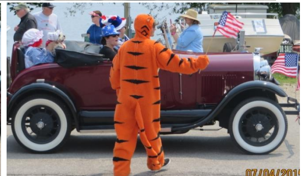
Community Parade at its Finest!