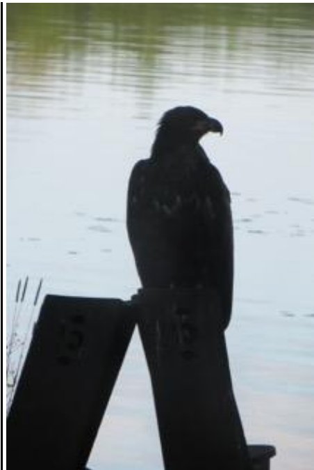
Immature eagle in flight training... Dick Elliott