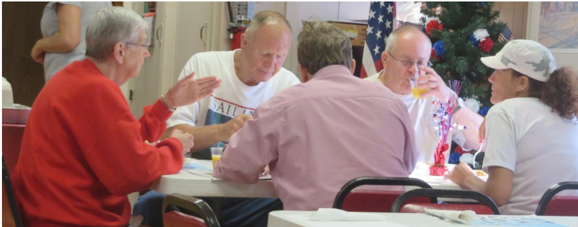
Work + Fun + Food = Yummy Pancake Breakfast