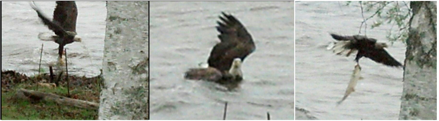
Who needs a fishing pole?